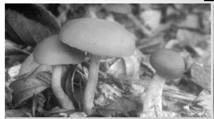
Psilocybe allenii . USA, CA, Oakland, 5 January 2006 leg. Peter G. Werner.